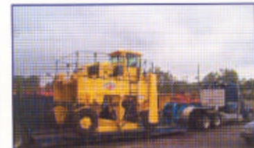
Off to Jim Beam Brands Distillery!