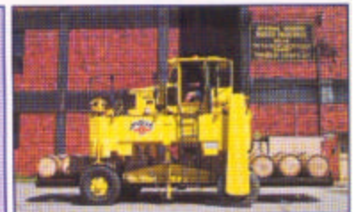
Jim Beam Brands Distillery barrel loaded.